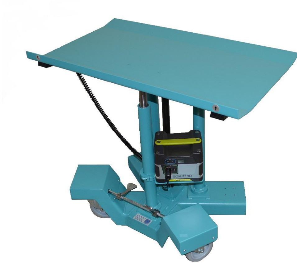
THW 3S EB T100