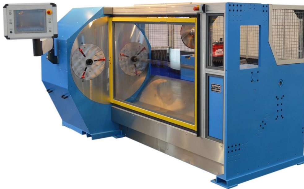
MOLEY®-Standard 400/1600 DS